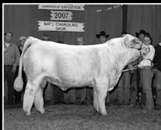
Kass Kojack S45 Daughter Sells

Visit www.Keystoneinternational.state.pa.us or AICA website to view the sale offering.