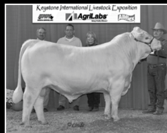
SMR Waldorf 83W Pld 2 Full Sisters Sell