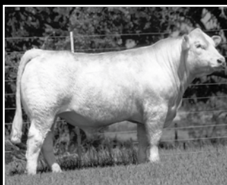
HBR Equalizer 940 PET Daughter Sells