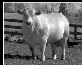
SSF Corks 5J White Squall ET Daughter Sells